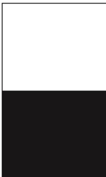
Half Page 4.5" x 3.75" 4 1/2" x 3 3/4"