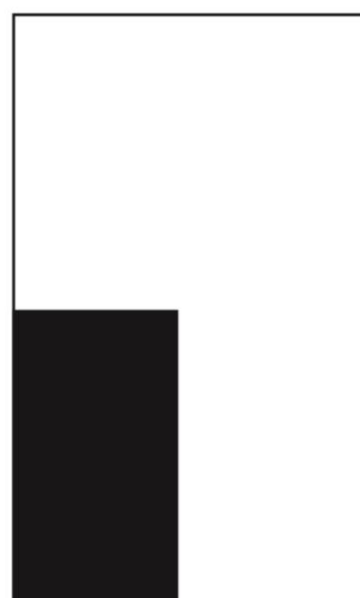
Business Card 2" x 3.5" 2" x 3 1/2"